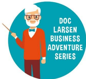
Doc Larsen Business Adventure Series

Teach young adults to fish and they eat. Teach young adults entrepreneurship and they think about business, understand how it works, how you evaluate ideas and shape ideas into business opportunities. Entrepreneurship empowers young adults with a head start - thinking 'out of the box', testing traditional ways of thinking, translating physical actions into models to drill-down on potential opportunities. Entrepreneurship empowers young adults with a competitive edge entering the job market regardless of what career path they pursue. Entrepreneurship teaches students critical thinking, problem solving, creativity, teamwork, ethics, social responsibility and how to plan, develop, launch and manage a new business.